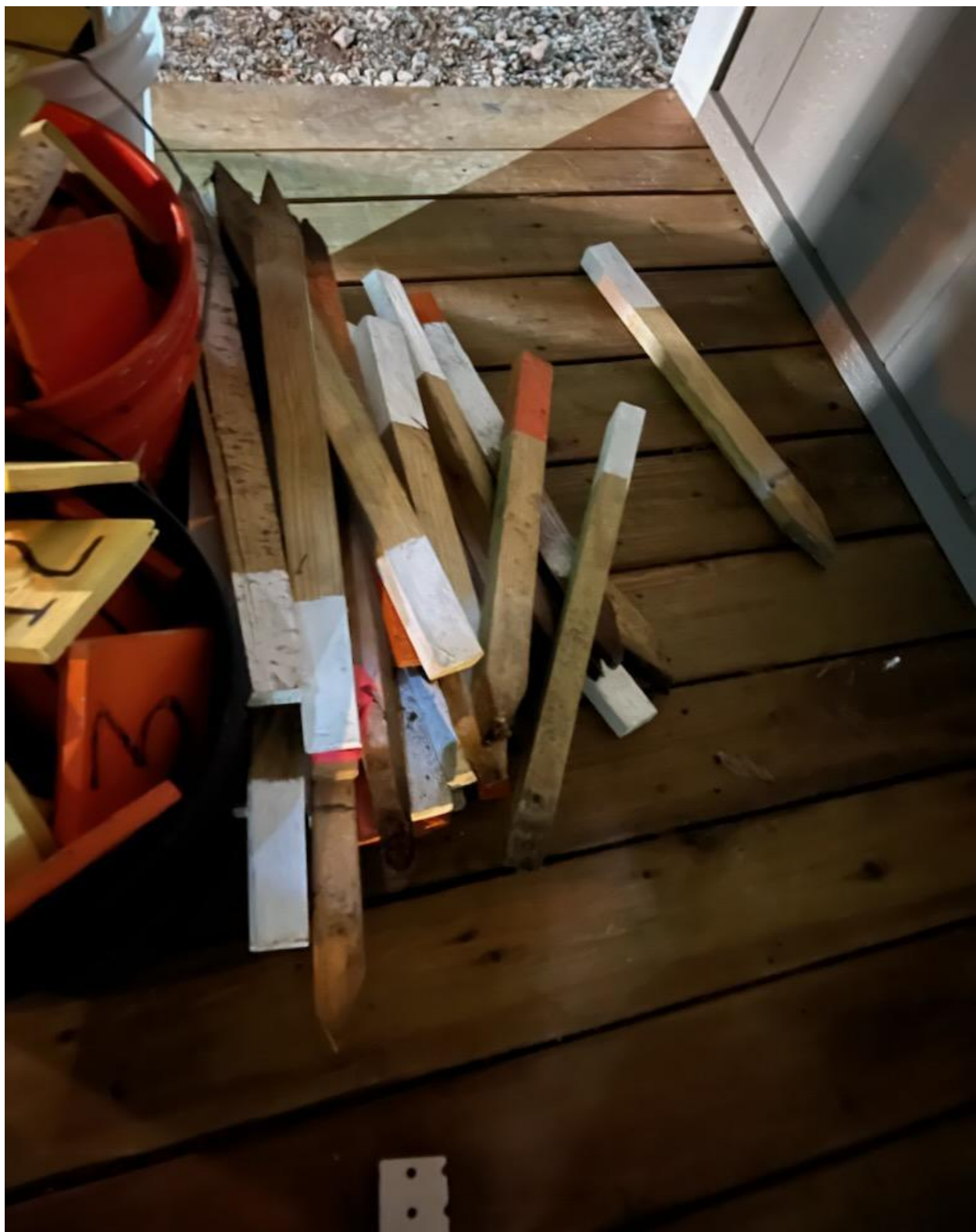
Above, after the cleanup.